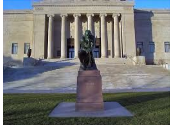
Nelson Art Gallery

We gain influence from cultures and time periods and can use that in our work.